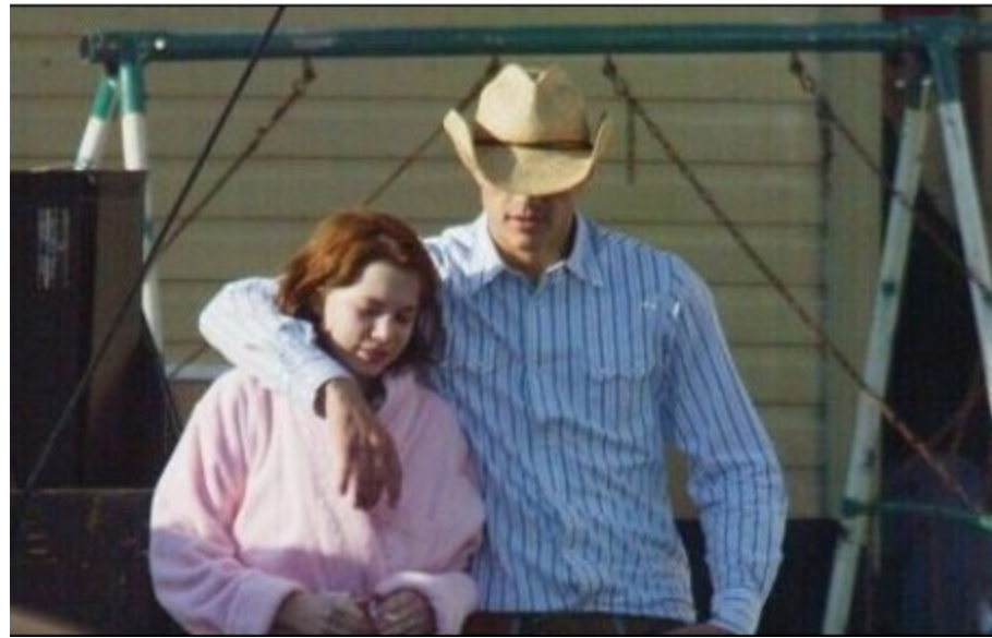
Williams and Ledger at the Laundry Apartment Fort Macleod, Alberta