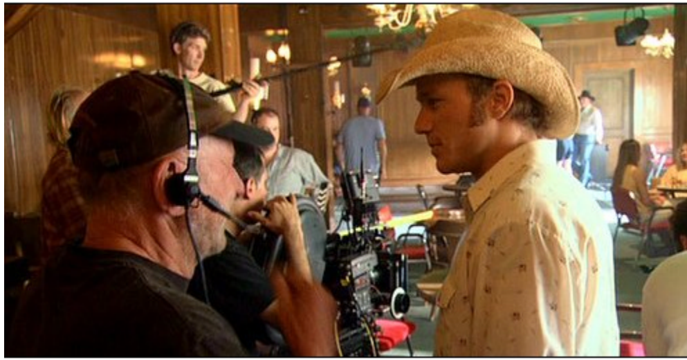
Cassie's Bar Fort Macleod, Alberta

In June 2004, while the production was based in Fort Macleod, Ledger visited the seedy Queen's Hotel bar (Cassie's Bar) and stayed up late, drinking with the locals. Some of the guys we met there remembered that. Unfamiliar with the Brokeback story line at the time, they jokingly offered to double for Heath in his movie's sex scenes.