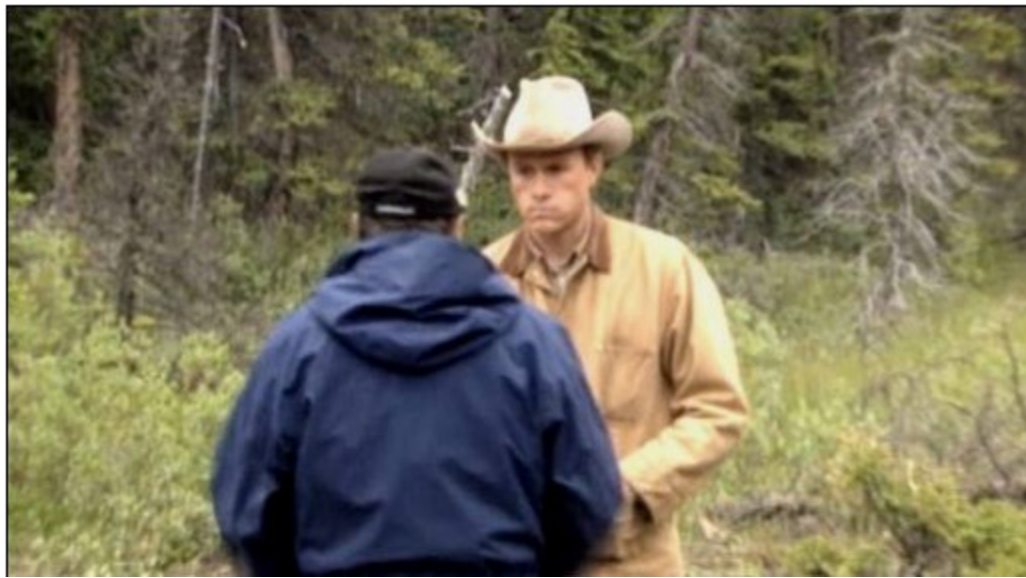
Lee and Ledger at Campsite #2 Goat Creek, Spray Valley Provincial Park, Alberta

Ang Lee insisted on perfect lighting for the Basque Bridge scene. In the hours that the cast and crew waited patiently for the sun and clouds to cooperate, Ledger took off his shirt and hung from the underside of the bridge, clowning around, greatly amusing the crew.