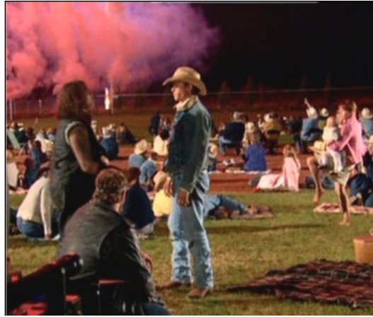
The Fireworks Scene Fort Macleod, Alberta

During the shooting of the difficult fireworks scene in Fort Macleod, it rained very hard. The babies (twins were rotated to comply with child welfare regulations) were crying a lot. "Ledger held them like a father and calmed them down. He loved kids," said a crowd extra who was positioned nearby.