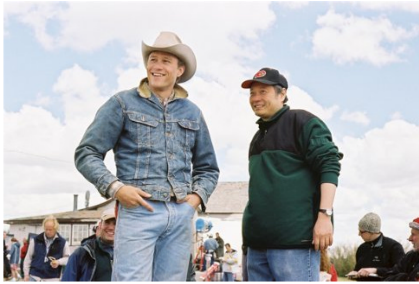
Ledger and Lee at the Lonesome Ranch Near Claresholm, Alberta

And, as has been reported, it was Ledger's inspiration to reverse the shirts for the final scene, never imagining that it was to become his own, enduring valediction. Yes, he really did get it, didn't he?