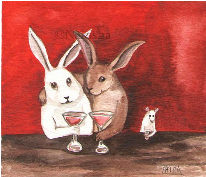
Drinking Bunnies ~ Picture from Flickr

From Le Bar , Sid401k asks: Is that anything like fishin bunnies? 🐰