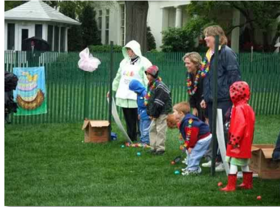
White House Easter Egg Roll, 2006

The White House Easter Egg Roll has been an annual tradition since 1878. In 2006 a group of same-sex couples and their children became the first gay-headed families to attend, leading to accusations that they were "crashing" an event that should be off-limits to them. The White House had expressed no objections, although the families complained that they were shut out of the opening ceremonies and the corresponding media coverage.