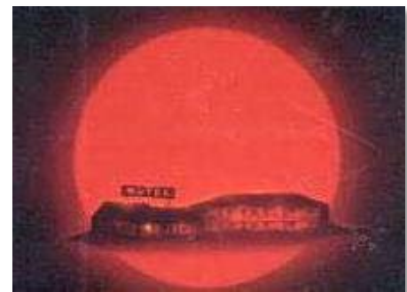
Cover illustration for Strangers .

Recently I re-read a book by Dean Koontz, one of my favorite authors, and did a double-take when a character named "Jack Twist" was introduced. He's one of the main characters in Strangers , a story similar to Close Encounters of the Third Kind with more of an edge. Like Close Encounters , this story has a number of people become obsessed with particular images and irresistibly drawn to an isolated motel in Nevada -- a place they believe they've never been, but they turn out to be