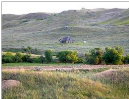
Road to Lightning Flat

For more information, see: Old Childress Place (8)