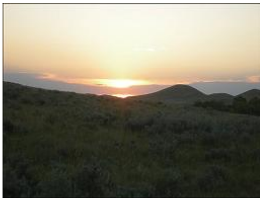
Sunset at the Old Childress Place

"The road to Lightning Flat went through desolate country past a dozen abandoned ranches distributed over the plain at eight- and ten-mile intervals, houses sitting blank-eyed in the weeds, corral fences down."