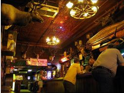
Inside the Mint Bar