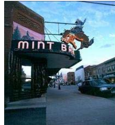
The Mint Bar, Sheridan, Wyoming

Since it first opened in 1907, Sheridan's Mint Bar has been satiating almost every kind of hunger out there. Originally a mere cowboy watering hole, the Mint promptly evolved into a combination bar and brothel. During Prohibition, the Mint became a speakeasy. Later, as a small casino, it offered lucky patrons various slot machines and table games.