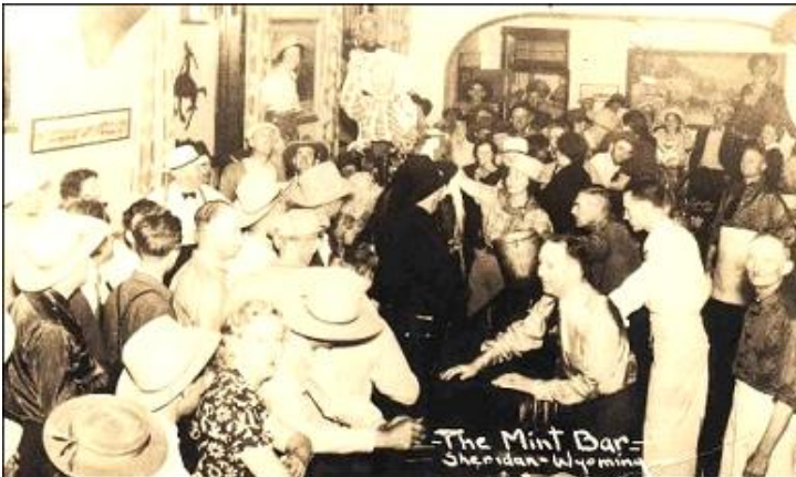
Gambling at the Mint Bar c. 1935

"But the incident that actually made me start writing it was one night when I was in a bar in Sheridan, Wyoming—the Mint Bar. There was a ranch hand I used to see. This guy was back leaning against the wall by the pool tables. The bar was packed with good-looking women, and he wasn't looking at them—he was watching the guys .... He was about sixty, and he watched them with a kind of subdued hunger that made me wonder if he was country gay."