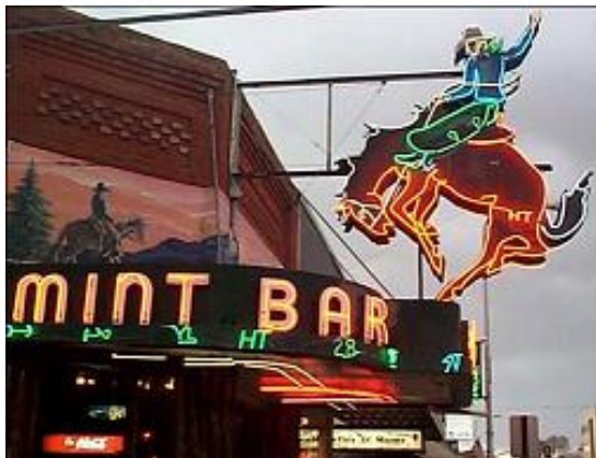
The Mint's Famous Neon Sign

History fans will appreciate the copy of Russell White Bear's map of the Custer Battle. But for most visitors, the real show-stopper is the Mint's priceless set of classic Charles Belden western photos, most of which were taken in the early 1900s at the Pitchfork Ranch in Meeteetse, Wyoming.