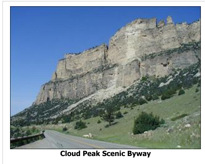
Cloud Peak Scenic Byway

For more about Signal Butte, Ten Sleep, and Ten Sleep Canyon, see: