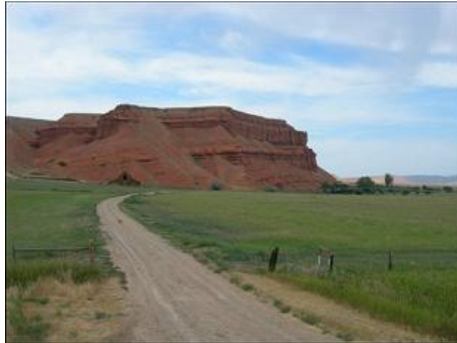
Signal Butte, near Ten Sleep, Wyoming