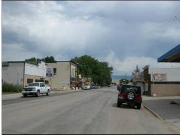
Ten Sleep, Wyoming