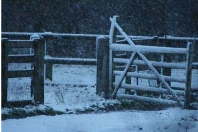
By Conny ~ the arrival of winter