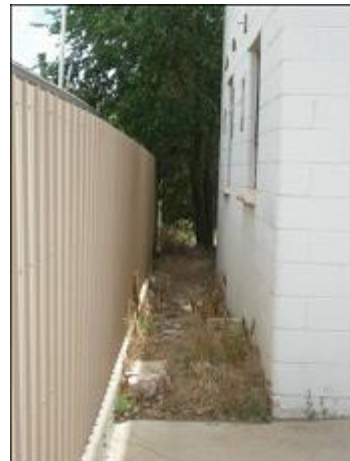
Alleyway, Ten Sleep, Wyoming

Is it a real place? Regardless of what you think about Signal, one of the most compelling reasons to visit Ten Sleep is to enter the captivating Ten Sleep Canyon and travel the Cloud Peak Scenic Byway, which extends 64 miles to the east through enchanting Big Horn Mountain scenery.