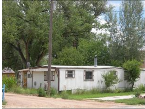
Trailer, Ten Sleep, Wyoming

Significant in Native American tradition, and prominent in the Range Wars (1909), Ten Sleep lacks a modern history of large scale sheep ranching. To find that, one must travel southwest, nearly to Idaho. But visitors to Ten Sleep will find plenty of suggestive Brokeback images to stimulate their imagination.