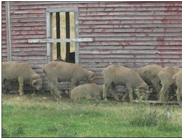
Sheep near Ten Sleep, Wyoming

Significant in Native American tradition, and prominent in the Range Wars (1909), Ten Sleep lacks a modern history of large scale sheep ranching. To find that, one must travel southwest, nearly to Idaho. But visitors to Ten Sleep will find plenty of suggestive Brokeback images to stimulate their imagination.