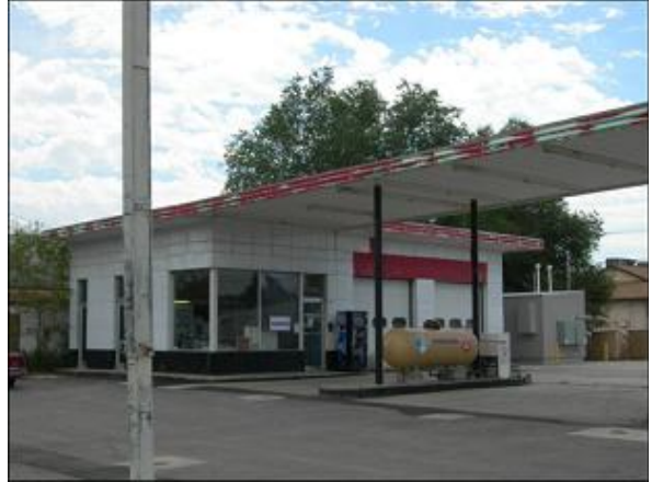
Vintage Gas Station, Thermopolis, Wyo.

Of course, modern gas stations are much more than their name suggests. Wyoming gas stations now function as liquor stores, lottery outlets, grocery stores, fast food restaurants, banks, DVD rental outlets, newsstands, coffee bars, and more. Good luck finding a real mechanic in one of these places! By contrast, the Brokeback filmmakers needed to find gas stations that not only reflected the period of the story, but that appeared to be buildings where real mechanics worked on cars. Despite the passing of the decades, Wyoming has more than a few of these structures remaining.