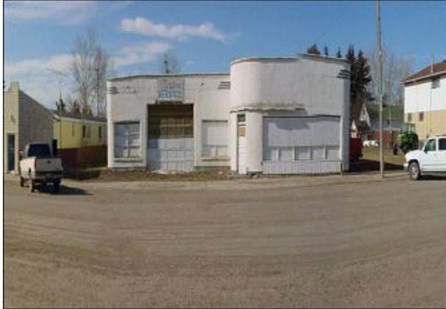
One Contender for the "Old Man" Gas Station Rockyford, Alberta