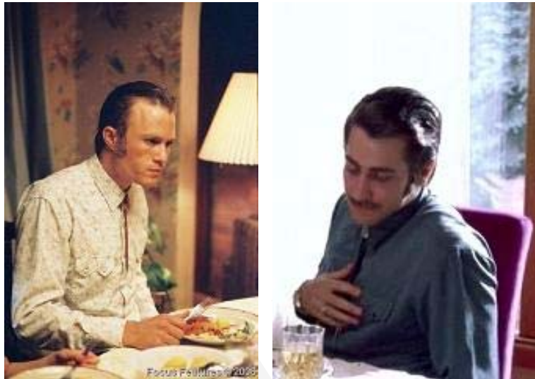
Ennis and Jack ( both think ): I sure wish I was eatin' elk right now...

By tfmisc ~ originally posted Nov. 23, 2006