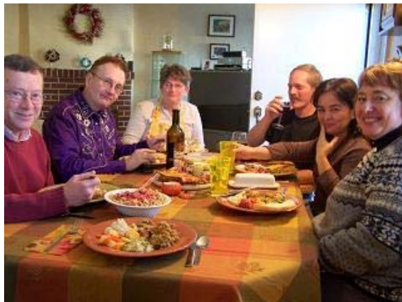
Thanksgiving with the best of friends

What does your family think of these changes over the last few years? "My family is pretty accepting. My two sons sorta understand, my youngest more so than my oldest, but they are accepting and wanting me to be happy. My dad totally understood; my mom does not. But, I have lived all my life for my parents, then my husband, and then my kids. I just let everyone know that now, this is my time.