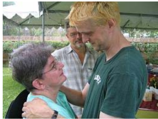
BBQ ~ 2006

How has Brokeback Mountain influenced changes in your life? "My life has changed so very much since that January 2006. Actually it started to change the September before. The BBQ I put on in August that year (2006) was the turning point for me. Everyone I had known and was acquainted with in Texas, I no longer felt in-tune with. I did not belong. My life had shifted for many reasons, but the movie made me see that I was living like an Ennis. Before the movie, I was just going to be satisfied living the life of a widow, in half a house and just exist."