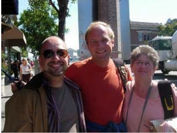
Exploring San Francisco together

have been lucky enough to meet, and some not. Never enough time, never enough...but I try.