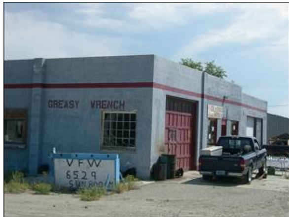
The Greasy Wrench Garage - Shoshone, Wyoming