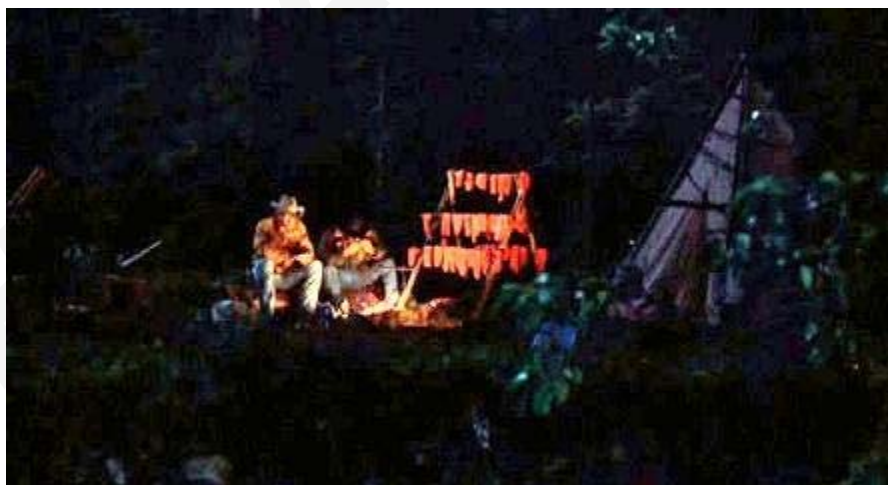
◆ caption by ifmisc ◆