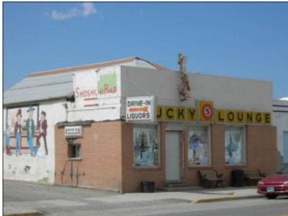
Lucky 5 Bar, Shoshone, Wyo.

Continuing a series of articles highlighting Wyoming places with important Brokeback connections..