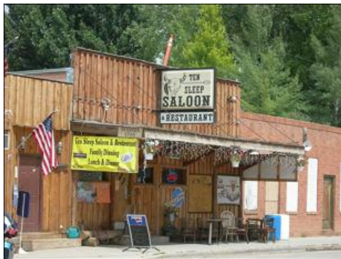
The Ten Sleep Saloon

There, more than a decade ago, Proulx watched a ranch hand, “leaning against the wall by the pool tables. The bar was packed with good-looking women, and he wasn’t looking at them — he was watching the guys .... He was about sixty, and he watched them with a kind of subdued hunger that made me wonder if he was country gay.”