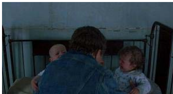
For they shall have the bestest wiper in Wyomin' ...you bet.