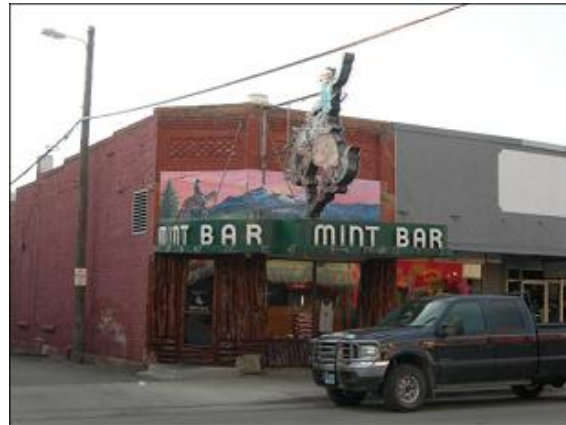
Mint Bar, Sheridan, Wyo.

Brokeback visitors to Wyoming will find a trove of buildings which plainly fit within the Proulx story and Lee's film. What follows is a sampling.