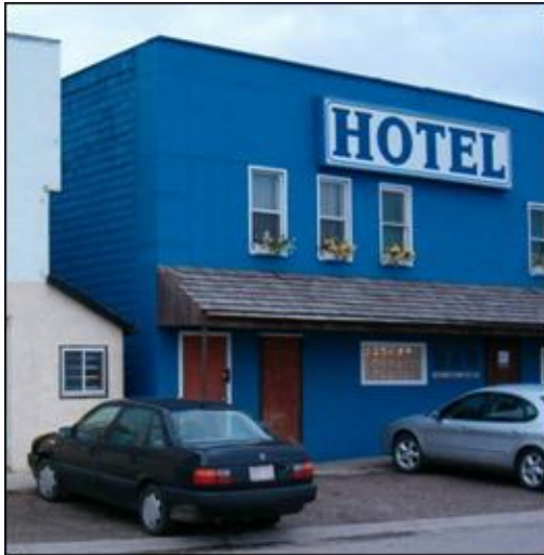
Before: Carseland, Alberta's "Blue Bar"