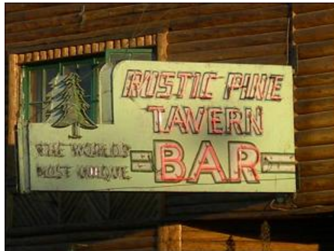
Neon Sign, Rustic Pine Tavern, Dubois, Wyo.