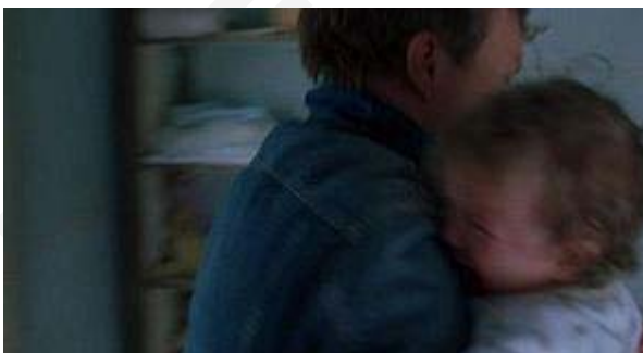
Blessed are the Runny-Nosed