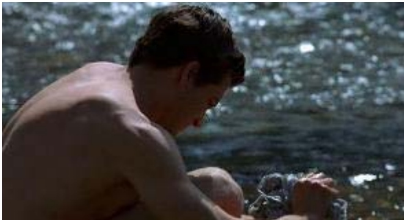
Blessed are the Cold and Unappreciated