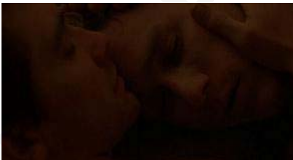
Blessed are the Loving