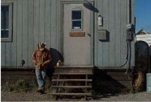
Blessed are the Lonely