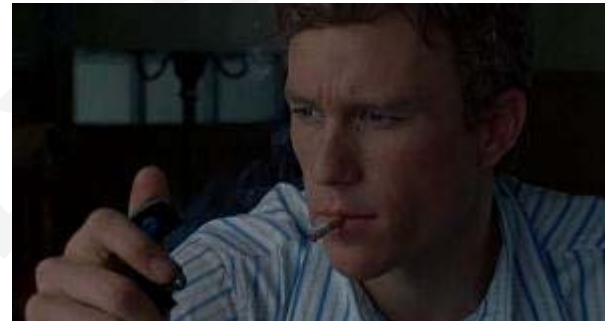
For they shall be Needed