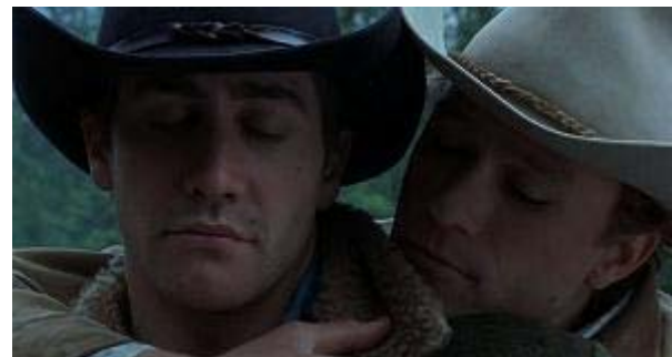
For love shall last Forever