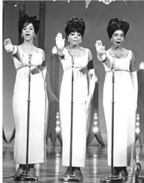
"STOP! In the name of love..."

BayCityJohn and Lyle (Mooska) posted this for those opposing the legalization of same-sex marriage: