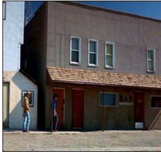
After: Ang Lee's "Signal Bar"

Lee was particularly impressed with the scenic area near Dubois, home to the Rustic Pine Tavern. "The world's most unique bar," brags its (failing) neon sign.