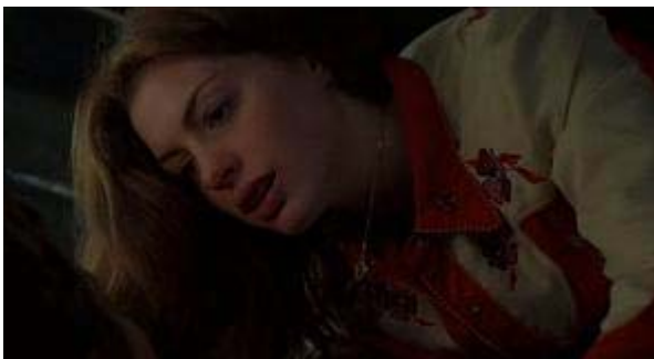
Blessed are the Style Deprived