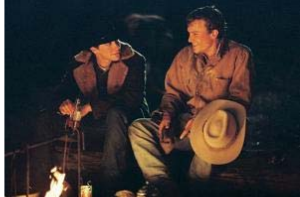
For they shall find a Friend.