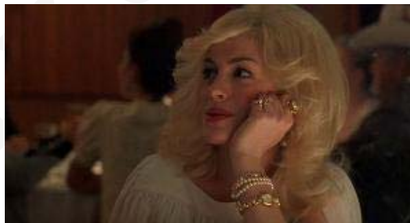
For they shall be made Blonde'