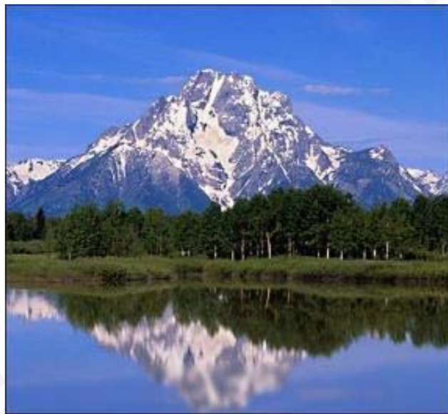
Wyoming's Teton Country: Stunning Mount Moran