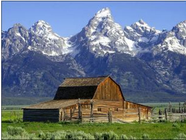
The Grand Tetons

Why is it that the Tetons, probably Wyoming's most famous icon, are treated in such an incidental manner? Most would agree that Proulx, McMurtry, Ossana, and Lee resisted the temptation to exploit familiar names and arresting imagery in order to draw attention away from geography and toward the essential human element of the Brokeback story.