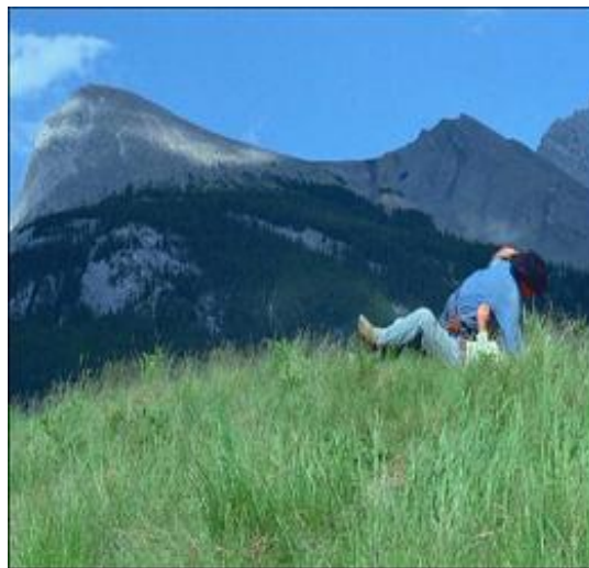
Alberta's Ha Ling Peak; Lee's choice for the "Get Goin', Cowboy" Hillside

Using images in lieu of words, Ang Lee made similar choices. Visitors to the movie's Alberta filming locations consistently remark upon Lee's mountain selections. In more than a few instances, images of mountains used in the film, beautiful as they are, are far less dramatic, less imposing, than "world class" mountains located in the same area.