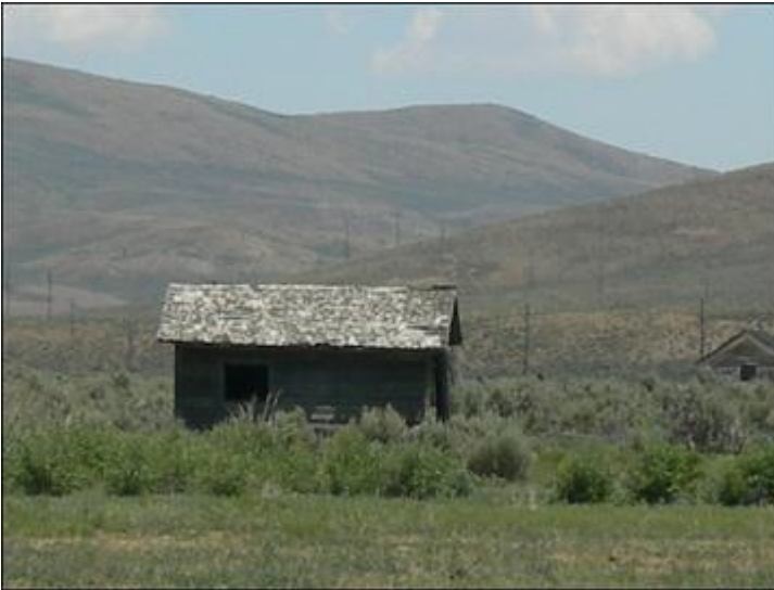
"They were raised on small, poor ranches ..."

"Sage" is a pretty simple name, fundamentally different from the unusual, unexpected compound "Lightning Flat." It is a perfect fit for Ennis del Mar. Just one syllable, only four letters, "Sage" is among the very shortest of Wyoming town names. (Her other possibilities were Bill, Elk, and Ulm.)