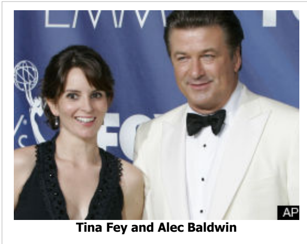
Tina Fey and Alec Baldwin

During a Time magazine interview, Alec Baldwin "took a moment from discussing art's importance to compliment Heath Ledger: "Watch a movie like Brokeback Mountain , which is an incredible movie. You know, Heath Ledger dying was this huge tragedy because he gave one of the greatest screen performances of a male performer in 50 years, literally. Like with Brando. I would never say that, but he was that great in that movie. Forget Batman and all this other crap. Brokeback Mountain was just unbelievable."