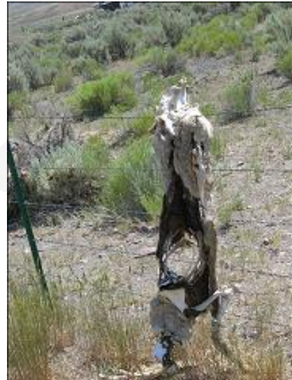
Coyote skeleton, Sage, WY

Then there is the plant for which the town was named. Though there are several varieties, the most common in this area is the Wyoming Big Sagebrush, artemisa tridentata wyomingensis . And it is common! The bulk of the state's hill country is covered with the stuff. Though it has a lovely odor, locals regard it as little more than scrub, a persistent weed. Well suited for the state's extreme weather and marginal soils, it is an incredibly tough, some would say "stubborn," plant.