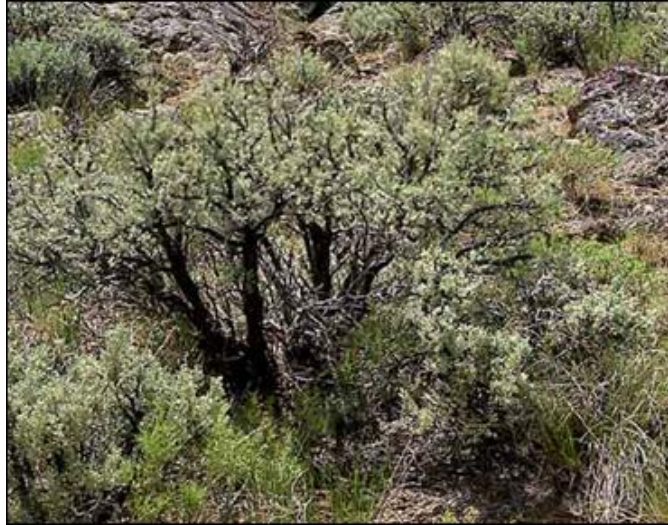
Wyoming Big Sagebrush, artemisa tridentata wyomingensis