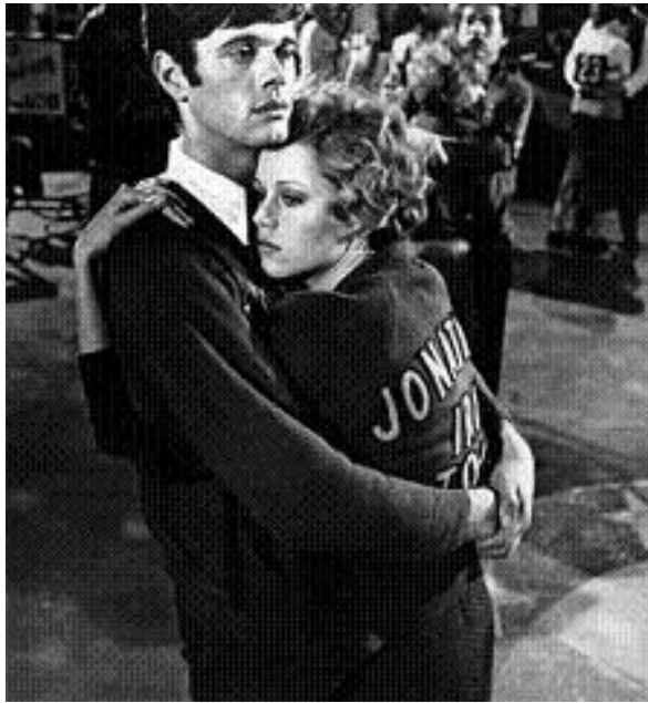
A scene from They Shoot Horses, Don't They?