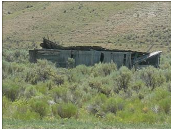
Sagebrush encroaches on a ruined building, Sage, WY

As Proulx tells us, Sage, Wyoming, is precisely on the opposite side of the state from Lightning Flat, some 600 miles, or 11 hours, away. Go any farther and you've left Wyoming. Jack was from the