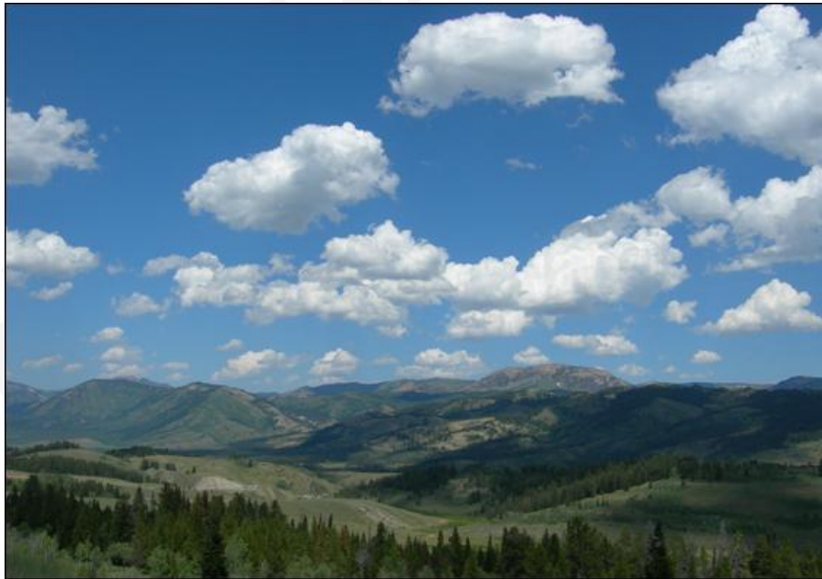
Wyoming’s Star Valley area near Salt River Pass