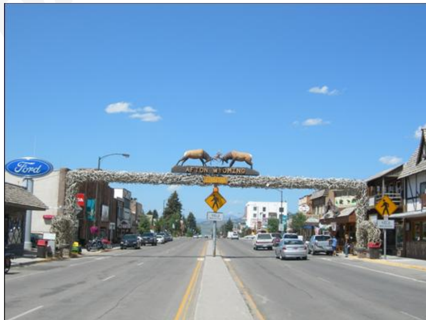
World's Largest Elk Horn Arch, Afton, WY

Prospective Brokeback visitors to Larry McMurtry's "Brokeback Country," as well as "armchair travelers," will enjoy this feature: McMurtry's Brokeback Area.