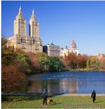
Central Park, NYC

I'm a bookaholic who loves cooking, baseball, travel, theater, and history. I'm a third generation New Yorker who was born in Manhattan and spent a lot of my childhood in the many museums. ( I particularly loved the armor gallery and the Egyptian halls in the Metropolitan.) I still love exploring cities. Most of my life, though, has been spent in Central New Jersey, where I still live. I was lucky enough to meet a true soulmate and we've been together for almost 30 years. I've worked as a psychologist and researcher, mostly with children and families, and doing nonfiction freelance writing.