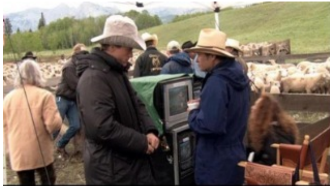
Ledger and Lee confer on set. Sheep Staging Scene, Morley, AB