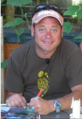
Trimble prefers signing autographs to packing soup boxes

The Basque is admittedly a secondary Brokeback character, but he is universally appreciated by all who admire and love the film. He is also a celebrated mega-star of the Photo Caption world.