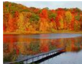
Lone Lake Park ~ Minnetonka, MN

When I first came to the sight and saw all the great names people were taking that had symbolism, meaning, clever alliterations and/or a personal-movie hybrid I thought about doing that as well, but nothing I could come up with was good enough so I decided to just be...me! (the one I came closest to using was TonkaTwist...yeah, I know...ugh, right?)