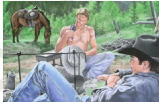
By Chris Rock